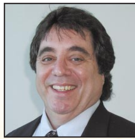
Al Thompson Cencal, Inc. (California)